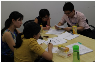
a. Using work place based assessments

Various modalities were used including videos, anonymised evaluations of the star performer and the struggling learner and role play with “standardised residents”. Final year IM residents and newly promoted SRs were invited to attend. Participants were asked for feedback at the end of the workshop that included qualitative comments.