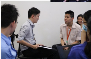
c. Role play with the difficult resident