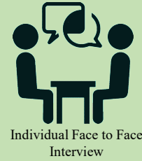
Individual Face to Face Interview

Please share your experience regarding: 1) What do you know about current status of health services, facilities, policies etc. for South Asian Ethnic Minority at the hospital? 2) What is your perception about patients of south Asian ethnic group? 3) What challenges do you face while treating SM patients? (Language: communication or expression, cultural restrictions, low health literacy, pain perception, only too many questions etc...) 4) What do you think about the role of relatives and friends accompanying a south Asian EM patient? 5) Have you ever had to use interpreter services to communicate with south Asian patients? If yes, what was your experience? 6) What do you think about the role of religion, culture and health beliefs in their healthcare treatment? 7) Do you think SM patients are satisfied with the treatment they received? 8) Do you think EM patients adhere with your medical treatment? If no, what do you do to improve the compliance? 9) What is your opinion about the clinical competency and cultural competency level of your doctor and nurse? 10) Do you have any recommendation to improve healthcare provider south Asian patient interaction? 11) Do you have any recommendation to improve healthcare provider south Asian patient interaction?